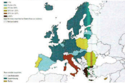
Figure 1. Percentage of invasive K. pneumoniae isolates with resistance to carbapenems, EU/EEA, 2017 [1]

Note: EARS-Net data are based on invasive isolates from blood and cerebrospinal fluid only; Bacteria isolated from other sites of infection or colonisation are not included.